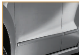
Side Body Moulding & Side Under Spoiler

The extremely practical Suzuki WagonR is loaded with an array of impressive accessories.