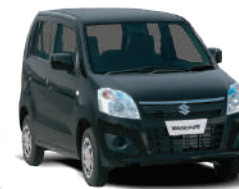
Super Pearl Black