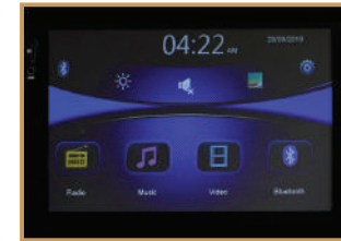
Infotainment System 9" Mp5 Touch Screen