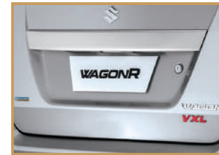
Rear End Chrome Garnish