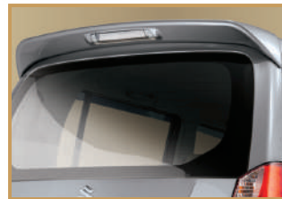
Rear Upper Spoiler