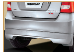
Rear Under Spoiler