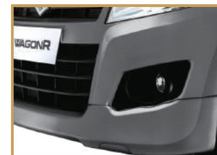
Front Under Spoiler