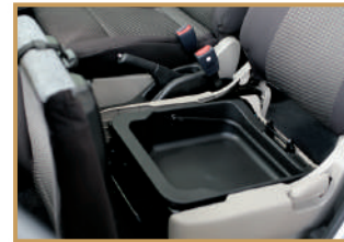
Front Passenger Under Seat Tray