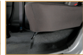
Rear Flat Floor