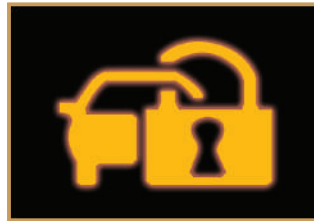
Immobilizer, Anti-Theft Security System